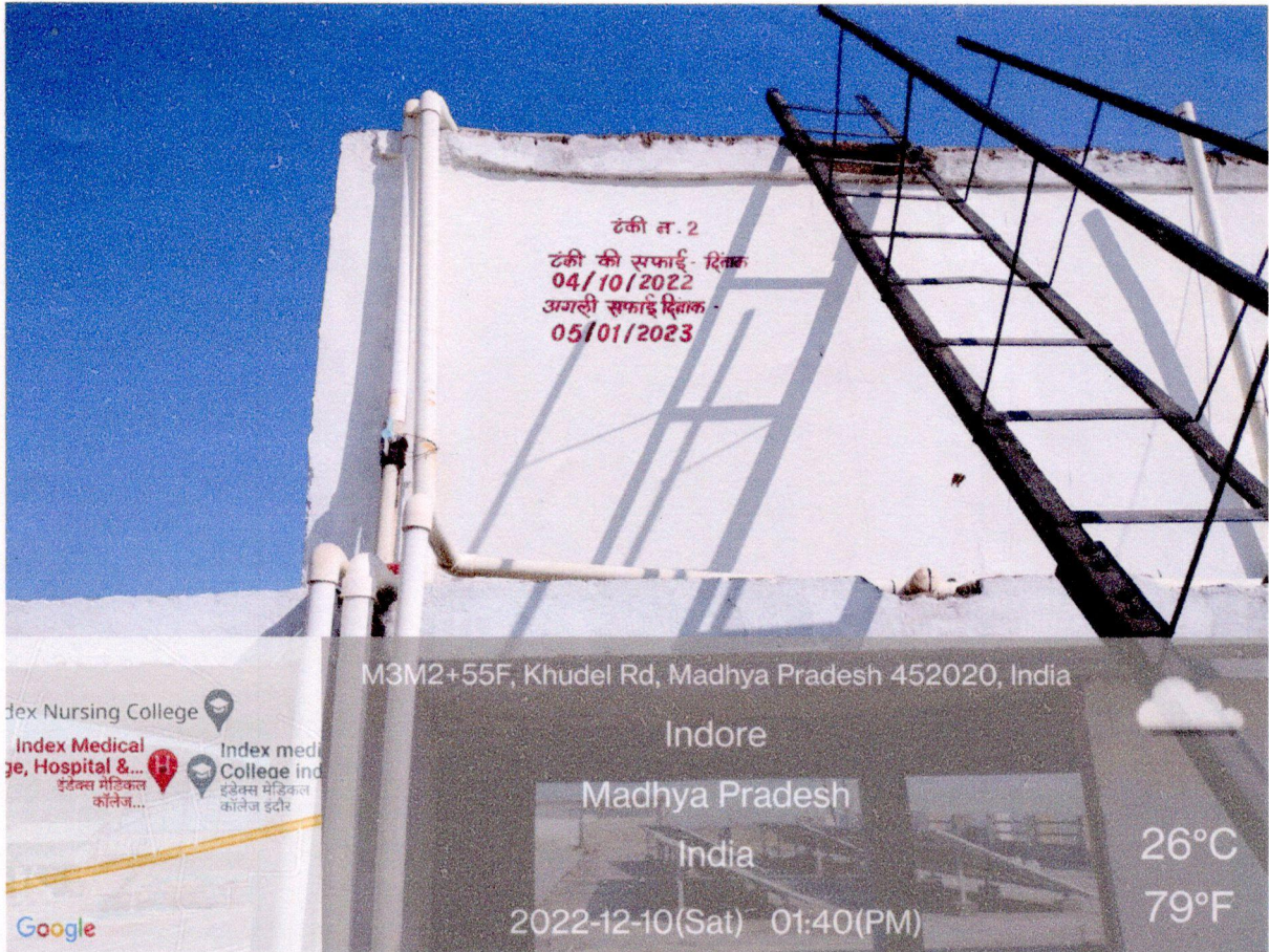
Photo: -Periodic cleaning of overhead tank

Handwritten signature Registrar Malwanchal University Indore (M.P.)